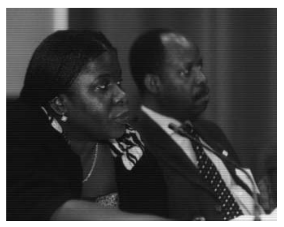
Finance Minister Luisa Diogo of Mozambique emphasized that poverty reduction strategies must address both economic growth and social issues to break the vicious cycle of poverty.

enhancing the representation and participation of poorer countries. International institutions need to be strengthened to respond to a host of new crises and shocks. The example of the Inter-American Development Bank was noted, which became in many respects the forum for dialogue among Latin American