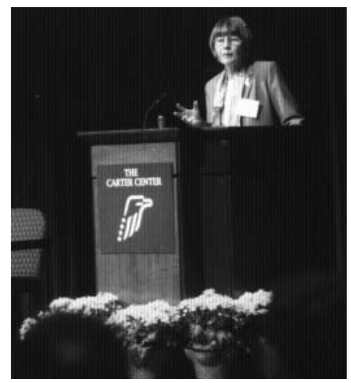
"The current global development architecture does not provide equal opportunities for rich and poor countries."

A debate continues to rage about the merits and demerits of market-led globalization for the poor. On one side of the debate are most mainstream economists, the United Nations, the World Bank and the other International Financial Institutions, most finance ministers and central bank governors in poor as well as rich countries, and most professional students of development. All of these generally argue that globalization is not the culprit in any increase in world poverty and inequality. It is, after all, the people least touched by globalization, living in rural Africa and South Asia, who are the poorest in the world. On the other side of the debate are most social activists; members of nonprofit civil society groups who work on environmental issues,