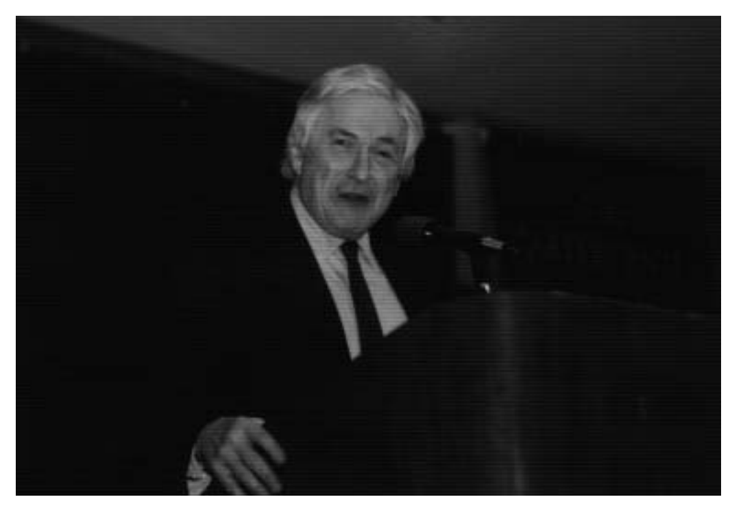
"Without support for capacity building, the way forward on development is extremely difficult."

0.7 percent. Xi We are at 0.23 percent. And now the air is full of a $50 billion figure per year, either immediately or over three years or over five years. Xii But it is absolutely clear that there is a need for additional resources.